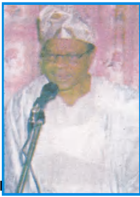
14. Dr. (Mrs)